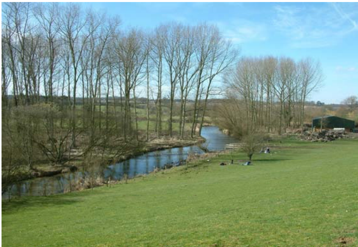
Experimental borehole array on the Lambourn at Boxford